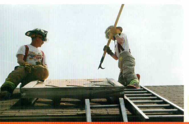
rs practice unfamiliar tasks and build confidence in their ability to meet new challenges.